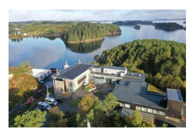
Thursday 16.5. : We go by bus and ferry to a blue (fishery) school, Austevoll Upper Secondary School <a href="https://www.austevoll.vgs.no/">https://www.austevoll.vgs.no/</a>

We get to know this school (also with a focus on collaboration), visit a fishing boat and other arenas for practical training, finish our workshops on the main topic and go back to Stend Upper Secondary School for General Assembly, and a break before the final dinner.